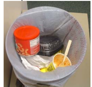
Hide in the trash

Do NOT dispose of medication down the drain or toilet.