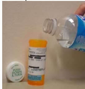
Mix with water and coffee grinds, cat litter, or dirt