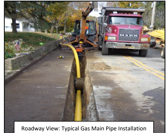
Roadway View: Typical Gas Main Pipe Installation