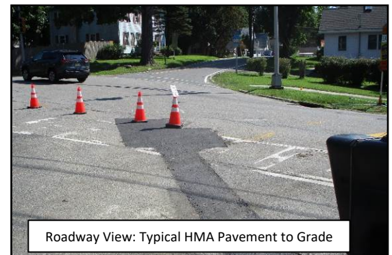
Roadway View: Typical HMA Pavement to Grade