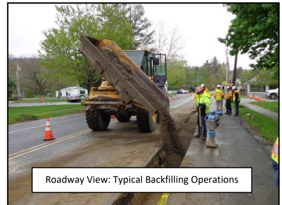
Roadway View: Typical Backfilling Operations