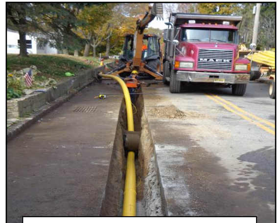
Roadway View: Typical Gas Main Pipe Installation