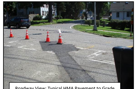
Roadway View: Typical HMA Pavement to Grade