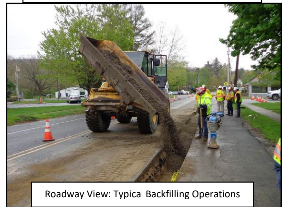
Roadway View: Typical Backfilling Operations