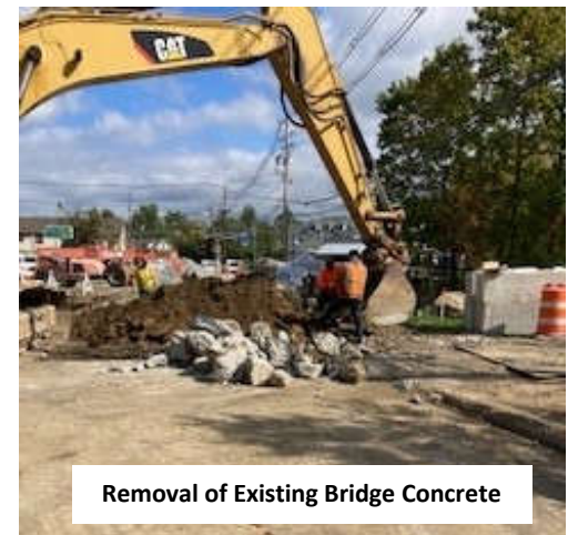
Removal of Existing Bridge Concrete