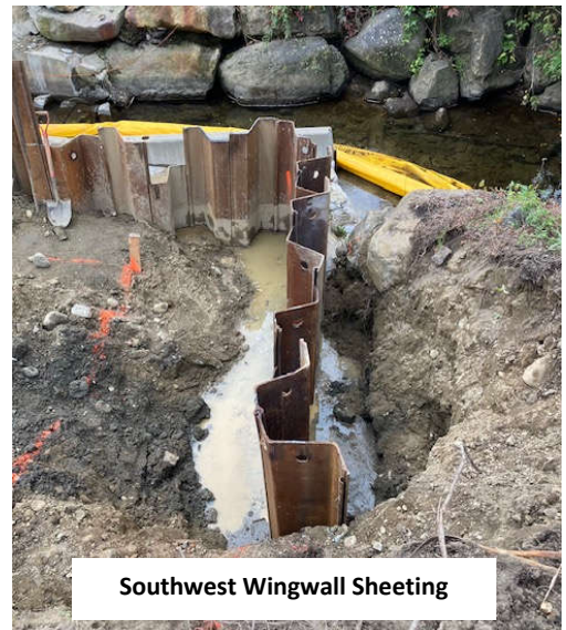
Southwest Wingwall Sheeting