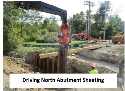
Driving North Abutment Sheeting