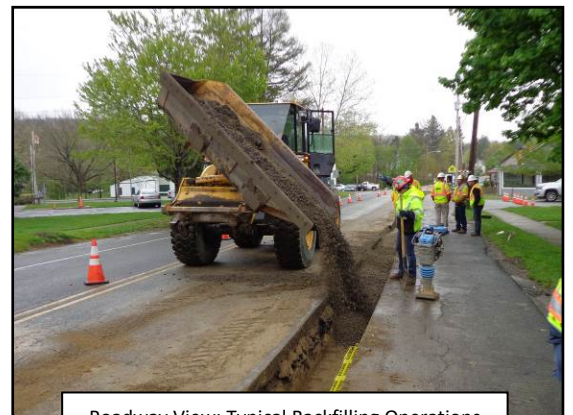
Roadway View: Typical Backfilling Operations