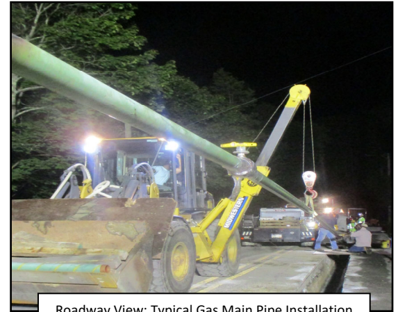
Roadway View: Typical Gas Main Pipe Installation