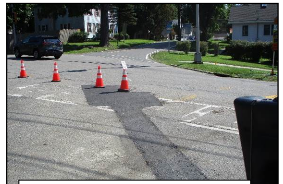
Roadway View: Typical HMA Pavement to Grade