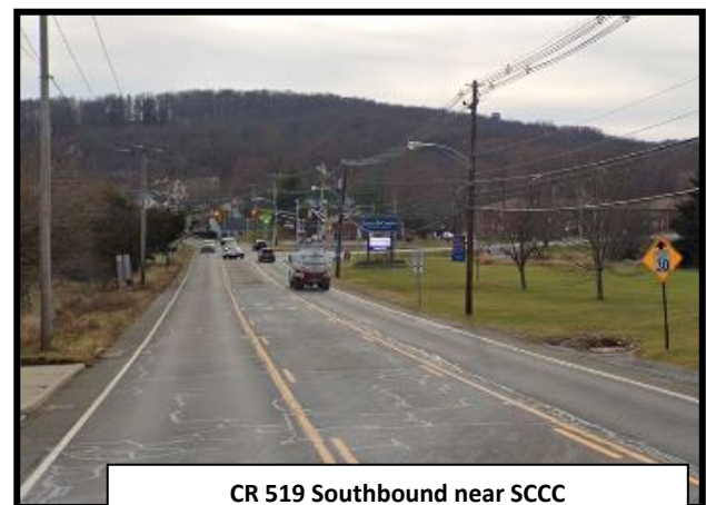
CR 519 Southbound near SCCC