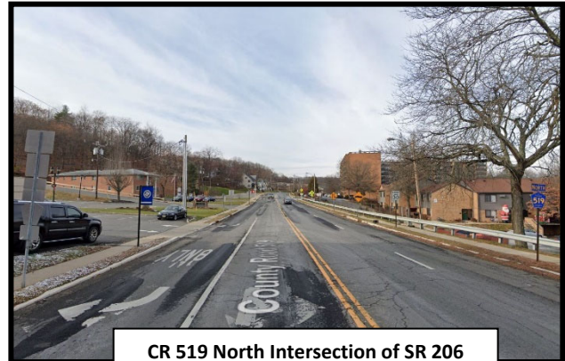
CR 519 North Intersection of SR 206