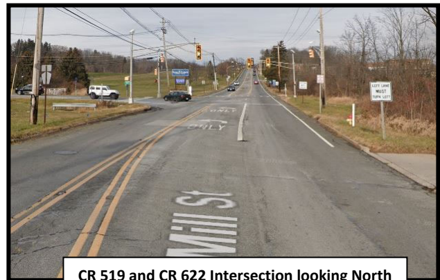
CR 519 and CR 622 Intersection looking North