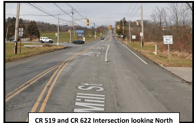
CR 519 and CR 622 Intersection looking North