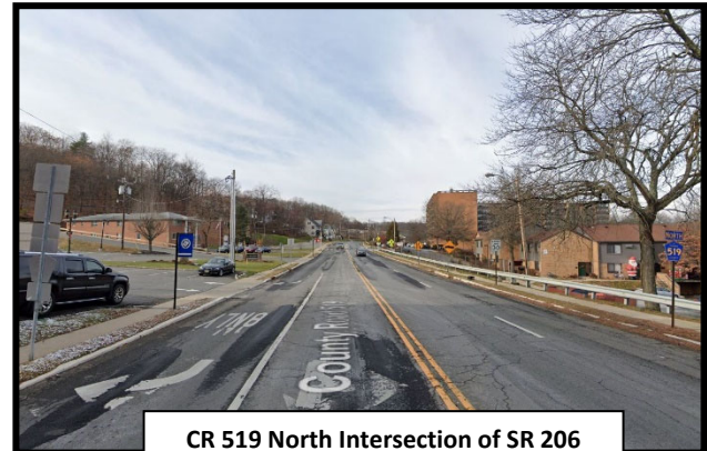
CR 519 North Intersection of SR 206