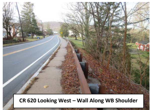
CR 620 Looking West – Wall Along WB Shoulder