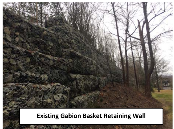
Existing Gabion Basket Retaining Wall