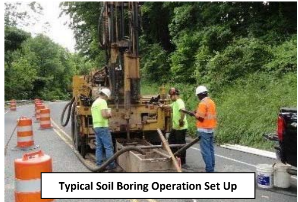
Typical Soil Boring Operation Set Up