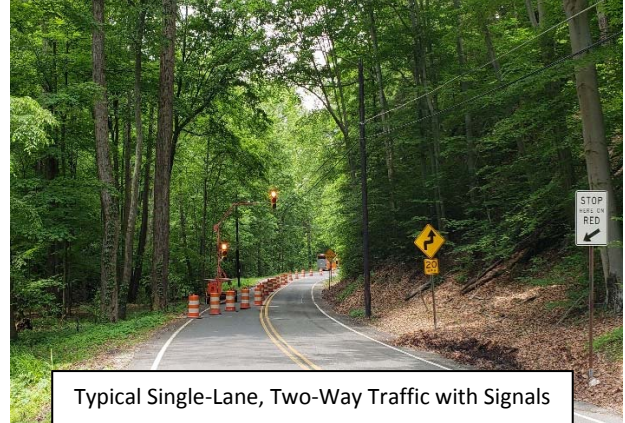
Typical Single-Lane, Two-Way Traffic with Signals