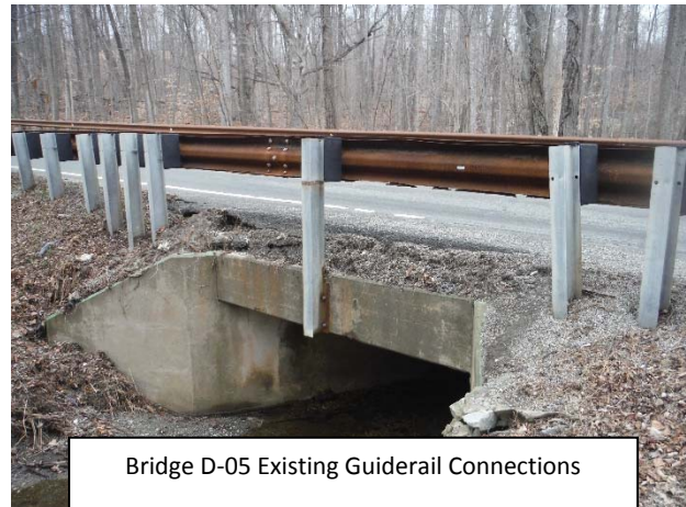
Bridge D-05 Existing Guiderail Connections