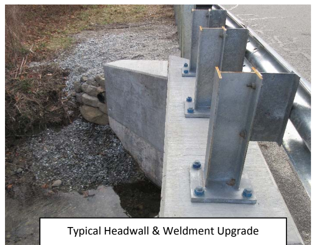
Typical Headwall & Weldment Upgrade