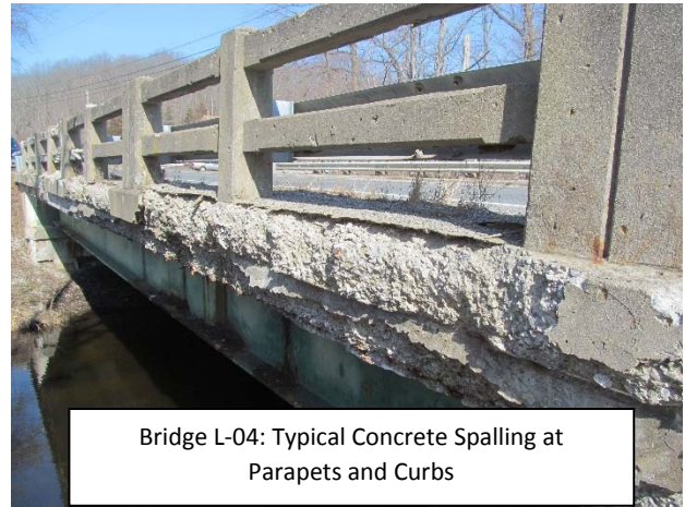
Bridge L-04: Typical Concrete Spalling at Parapets and Curbs