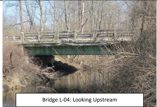
Bridge L-04: Looking Upstream