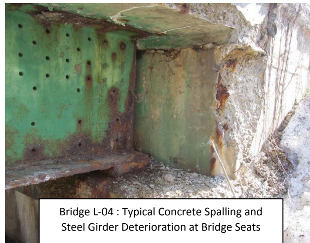
Bridge L-04 : Typical Concrete Spalling and Steel Girder Deterioration at Bridge Seats