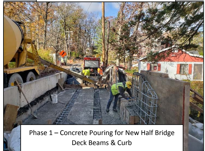
Phase 1 – Concrete Pouring for New Half Bridge Deck Beams & Curb