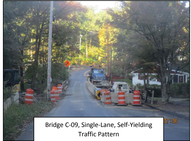
Bridge C-09, Single-Lane, Self-Yielding Traffic Pattern