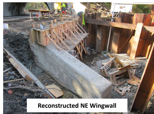
Reconstructed NE Wingwall