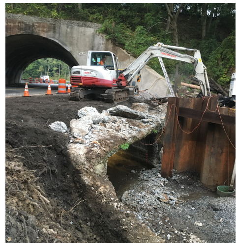
Demolition of North Headwall and NE Wingwall