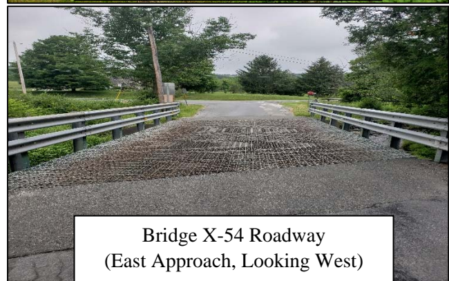
Bridge X-54 Roadway (East Approach, Looking West)