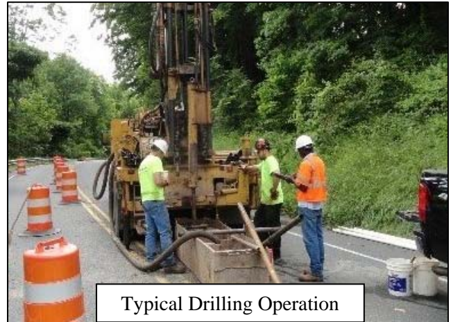
Typical Drilling Operation