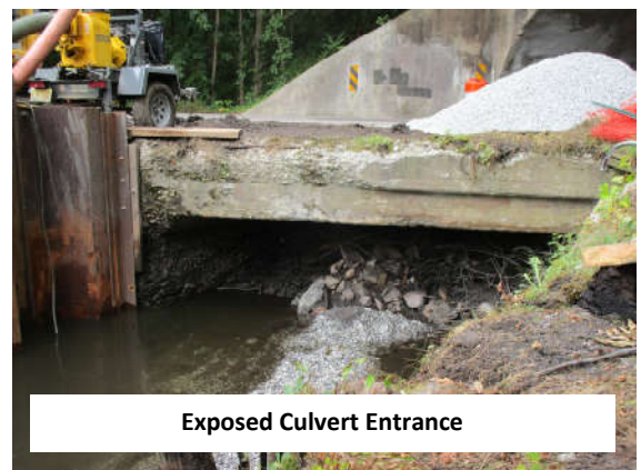
Exposed Culvert Entrance