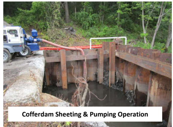
Cofferdam Sheeting & Pumping Operation