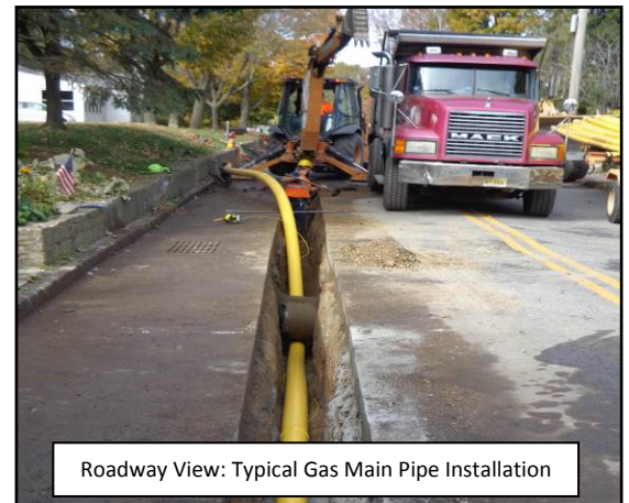
Roadway View: Typical Gas Main Pipe Installation