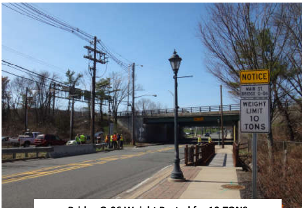
Bridge Q-06 Weight Posted for 10-TONS