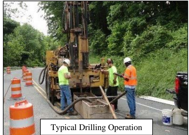
Typical Drilling Operation