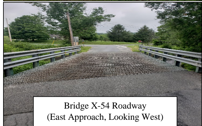
Bridge X-54 Roadway (East Approach, Looking West)