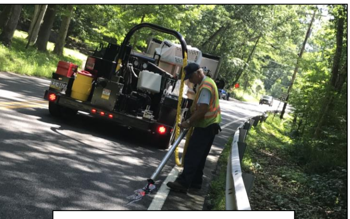
Filling cracks along County Roadways