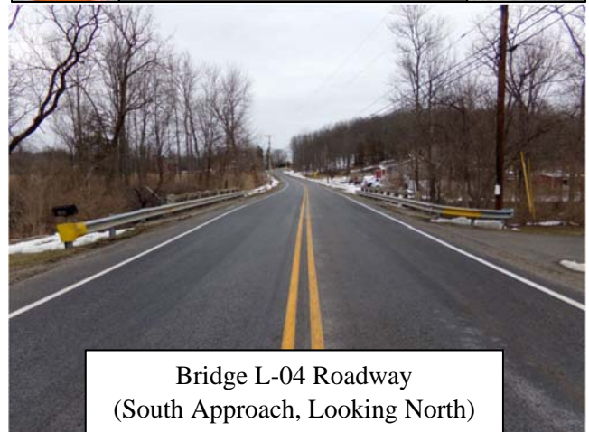
Bridge L-04 Roadway (South Approach, Looking North)