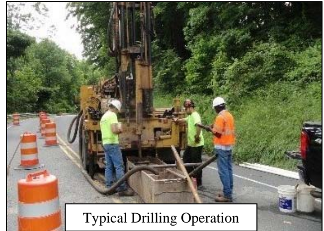
Typical Drilling Operation