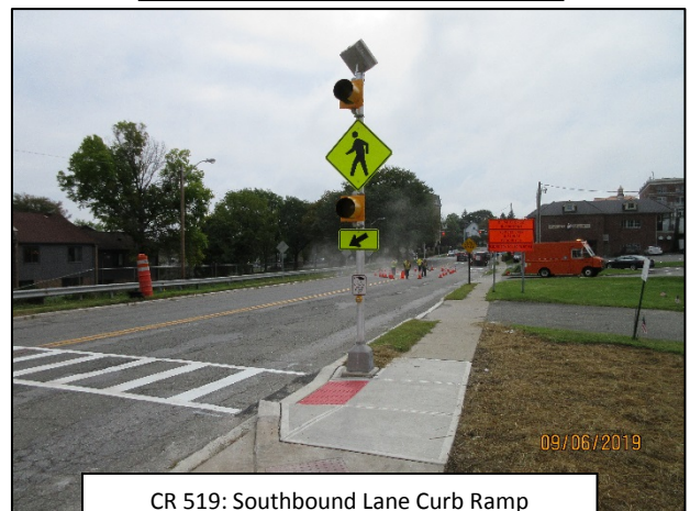
CR 519: Southbound Lane Curb Ramp