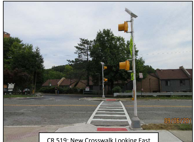
CR 519: New Crosswalk Looking East