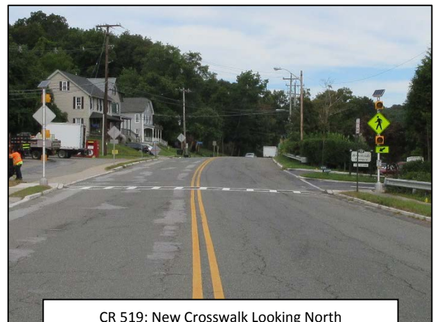
CR 519: New Crosswalk Looking North