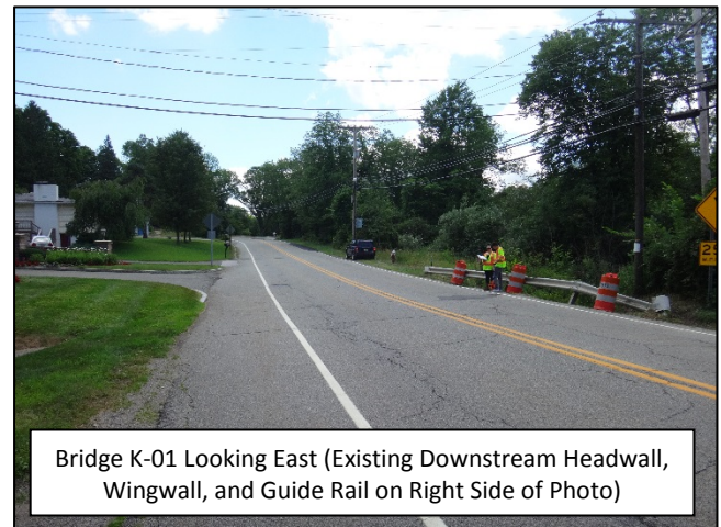
Bridge K-01 Looking East (Existing Downstream Headwall, Wingwall, and Guide Rail on Right Side of Photo)