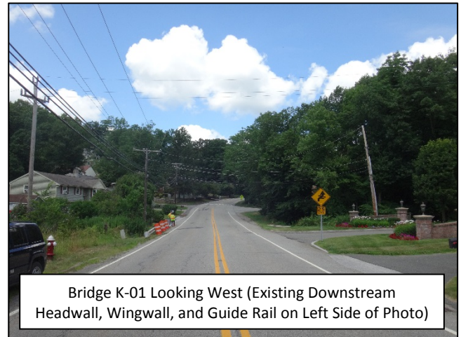
Bridge K-01 Looking West (Existing Downstream Headwall, Wingwall, and Guide Rail on Left Side of Photo)