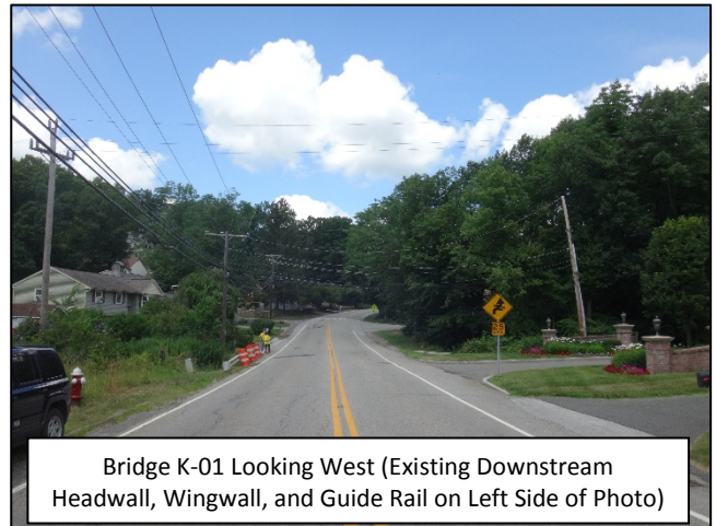
Bridge K-01 Looking West (Existing Downstream Headwall, Wingwall, and Guide Rail on Left Side of Photo)