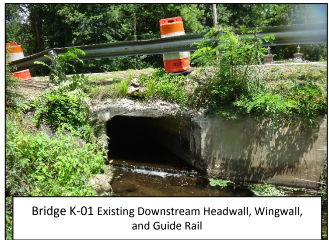
Bridge K-01 Existing Downstream Headwall, Wingwall, and Guide Rail