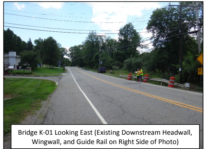
Bridge K-01 Looking East (Existing Downstream Headwall, Wingwall, and Guide Rail on Right Side of Photo)