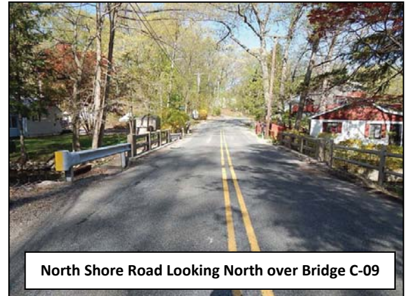
North Shore Road Looking North over Bridge C-09

Construction will be staged to permit passage of a single lane of alternating traffic for the duration of construction.