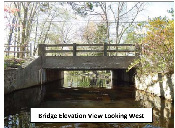
Bridge Elevation View Looking West