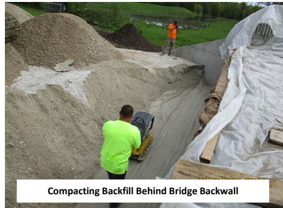
Compacting Backfill Behind Bridge Backwall