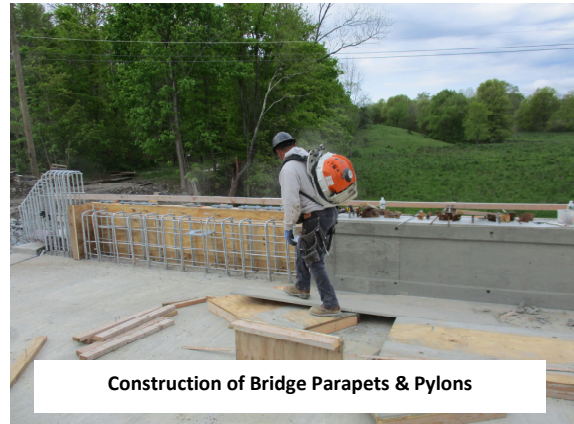
Construction of Bridge Parapets & Pylons