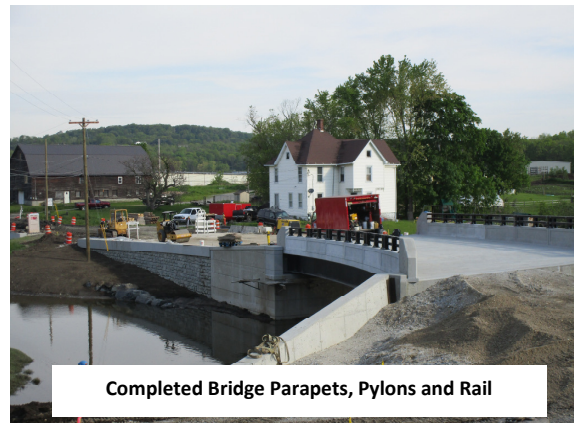
Completed Bridge Parapets, Pylons and Rail