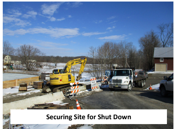
Securing Site for Shut Down