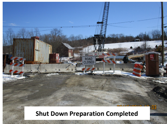
Shut Down Preparation Completed