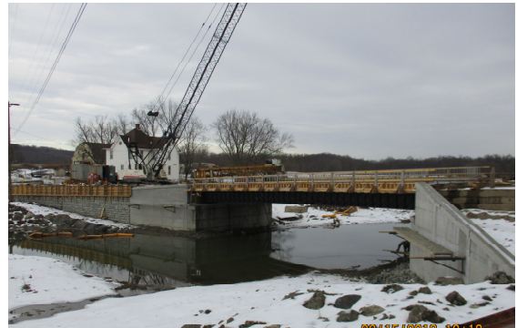
Deck & Retaining Wall Prepped for Concrete Placement