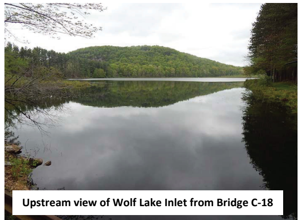
Upstream view of Wolf Lake Inlet from Bridge C-18