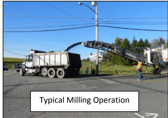
Typical Milling Operation