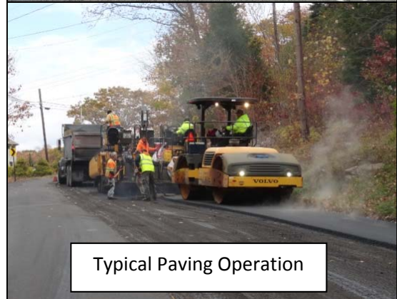
Typical Paving Operation