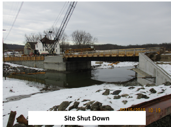
Site Shut Down