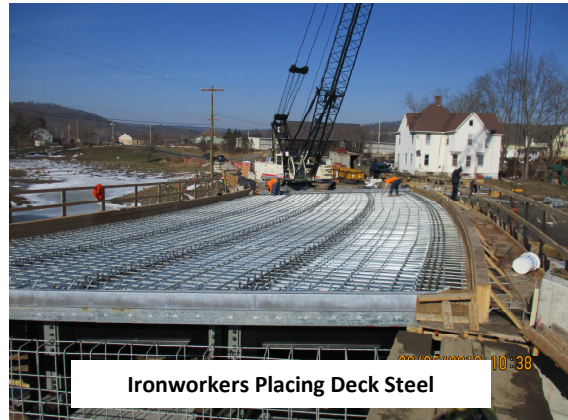
Ironworkers Placing Deck Steel