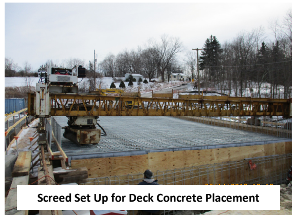
Screed Set Up for Deck Concrete Placement