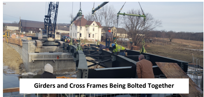
Girders and Cross Frames Being Bolted Together