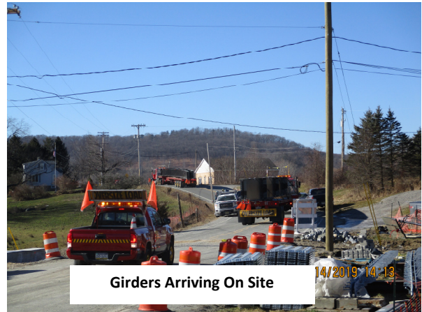
Girders Arriving On Site