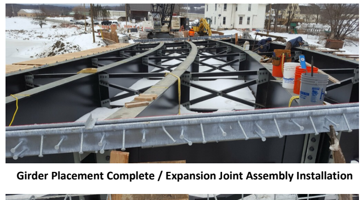
Girder Placement Complete / Expansion Joint Assembly Installation