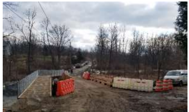
Bridge D-21: View of New Bridge Superstructure Looking East (Roadway Re-Opened)