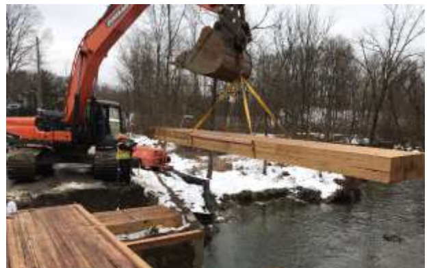
Bridge D-21: New Timber Superstructure Construction