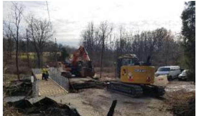
Bridge D-21: View of Existing Bridge Demolition and Pedestrian Bridge Looking East