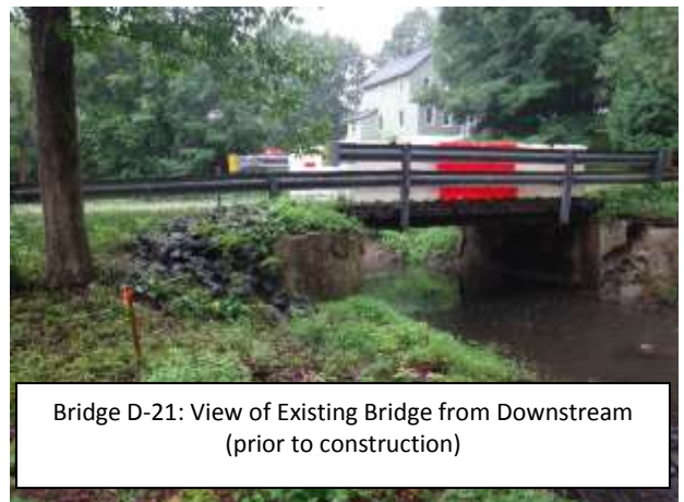
Bridge D-21: View of Existing Bridge from Downstream (prior to construction)