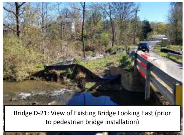
Bridge D-21: View of Existing Bridge Looking East (prior to pedestrian bridge installation)