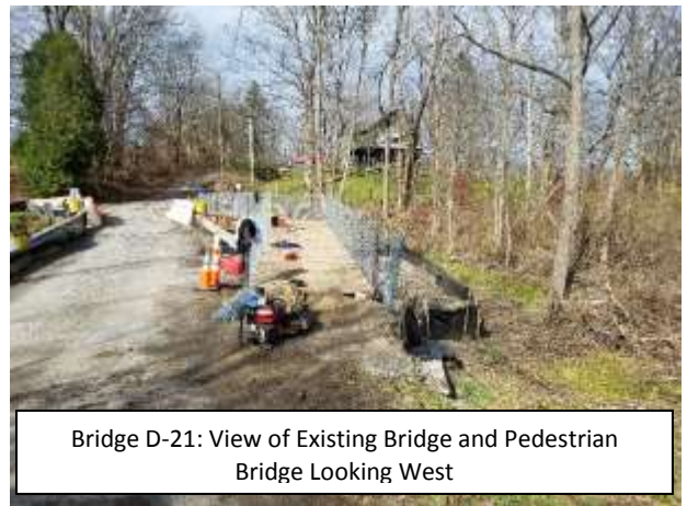
Bridge D-21: View of Existing Bridge and Pedestrian Bridge Looking West