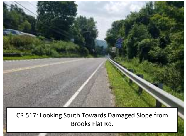
CR 517: Looking South Towards Damaged Slope from Brooks Flat Rd.