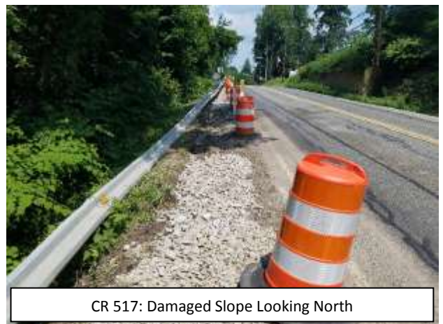
CR 517: Damaged Slope Looking North