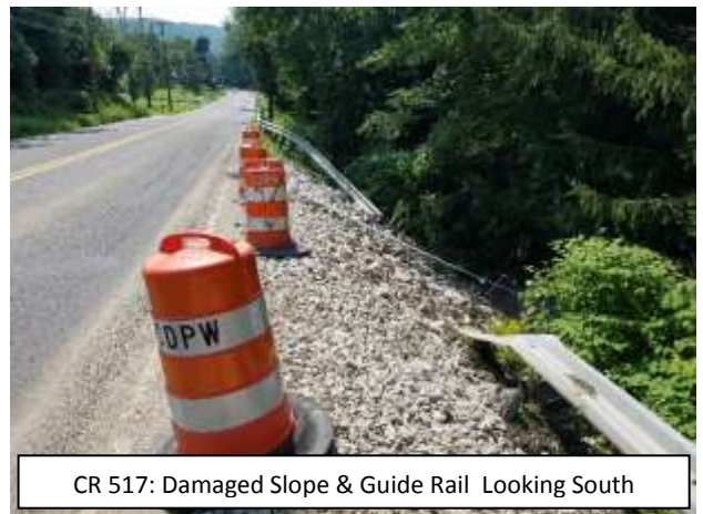
CR 517: Damaged Slope & Guide Rail Looking South