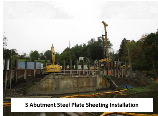
S Abutment Steel Plate Sheeting Installation