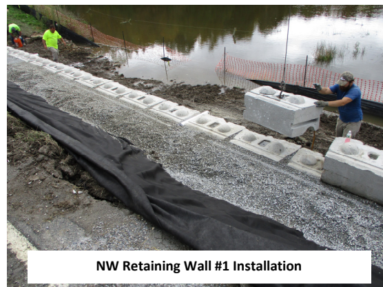
NW Retaining Wall #1 Installation