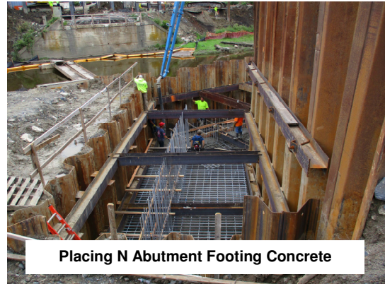
Placing N Abutment Footing Concrete