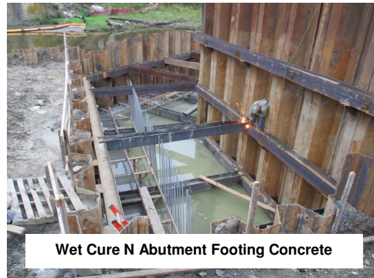
Wet Cure N Abutment Footing Concrete