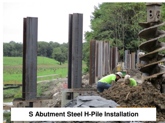
S Abutment Steel H-Pile Installation