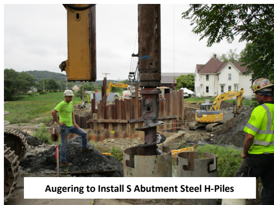
Augering to Install S Abutment Steel H-Piles