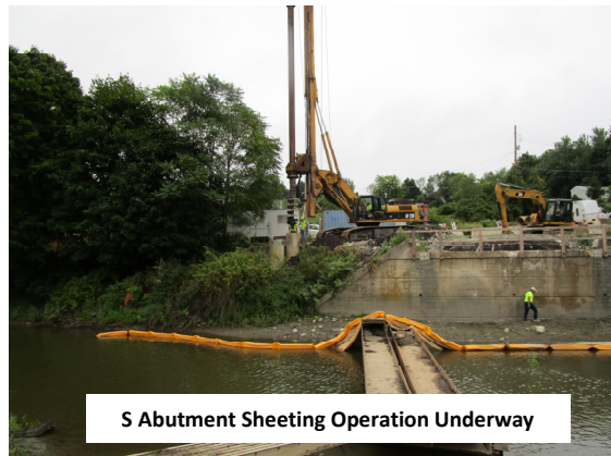
S Abutment Sheet piling Operation Underway