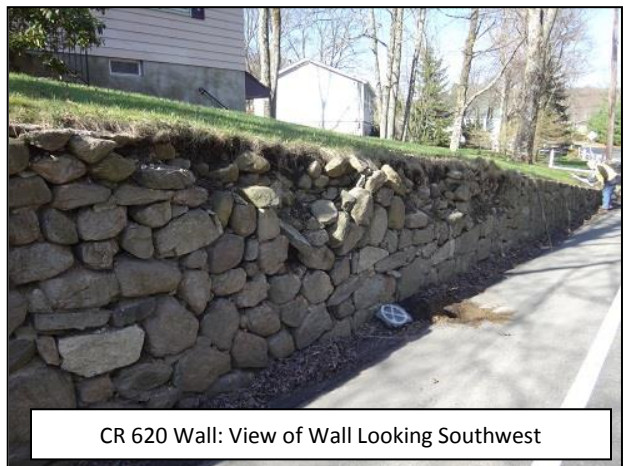
CR 620 Wall: View of Wall Looking Southwest