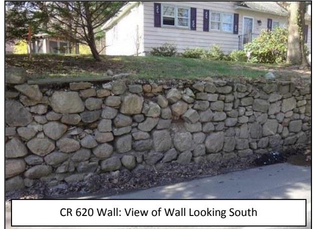
CR 620 Wall: View of Wall Looking South