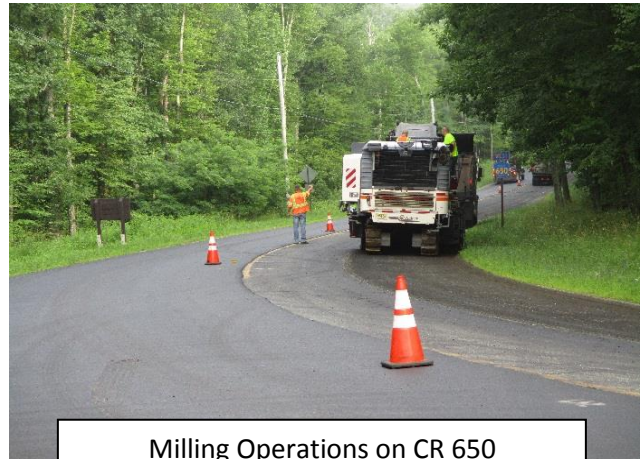
Milling Operations on CR 650