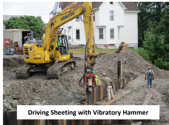
Driving Sheet piling with Vibratory Hammer