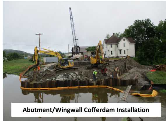
Abutment/Wingwall Cofferdam Installation