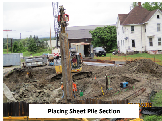
Placing Sheet Pile Section