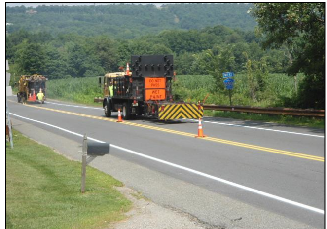
Typical Striping Operation