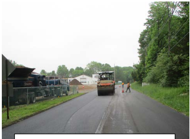
Rolling Operations on CR 669

Public Notice: FY2017 Resurfacing \\dpw-fs\EP_Docs\04 Asset\01 Road\000\PAVING\Pave 2017\03 Const\10 Corr\20 Notices\05 Pub Outrch\20180628_NTC_2017