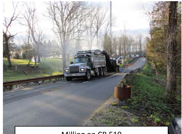
Milling on CR 519