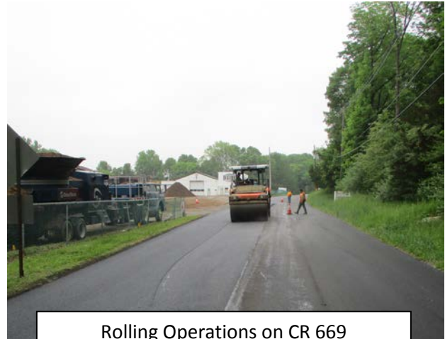
Rolling Operations on CR 669