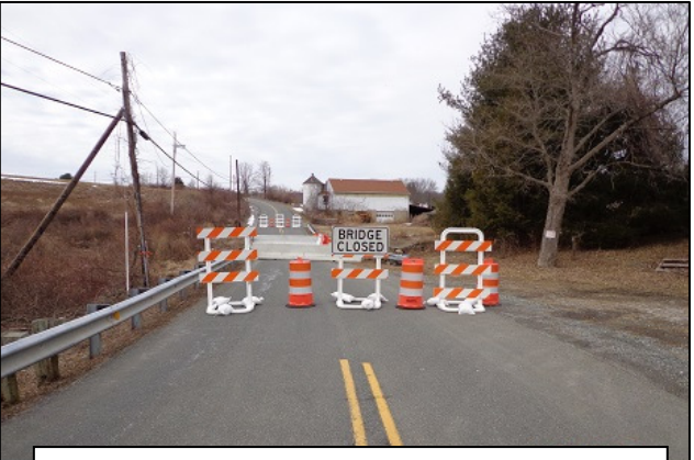
Bridge X-20: Berry Road Closed to Thru Traffic at Bridge