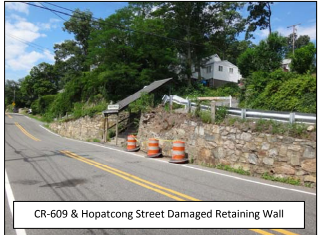
CR-609 & Hopatcong Street Damaged Retaining Wall