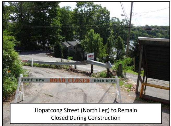
Hopatcong Street (North Leg) to Remain Closed During Construction