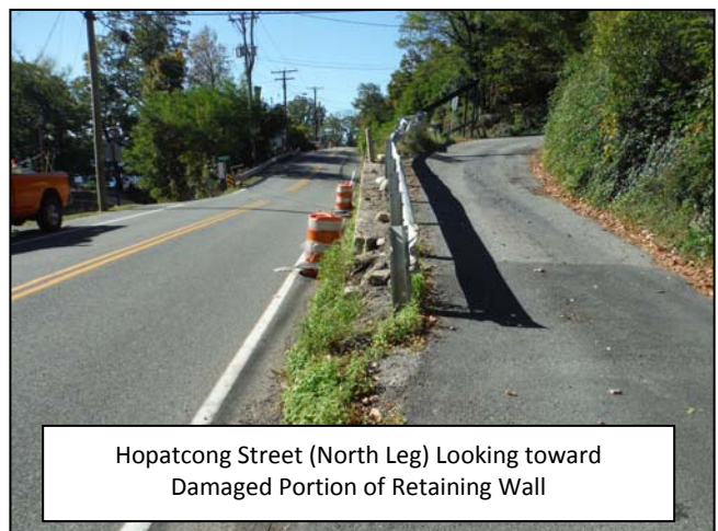
Hopatcong Street (North Leg) Looking toward Damaged Portion of Retaining Wall