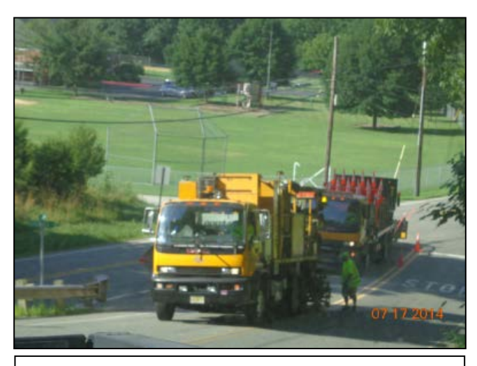
Typical Striping Operation