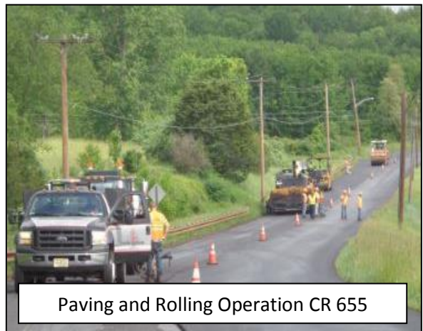
Paving and Rolling Operation CR 655