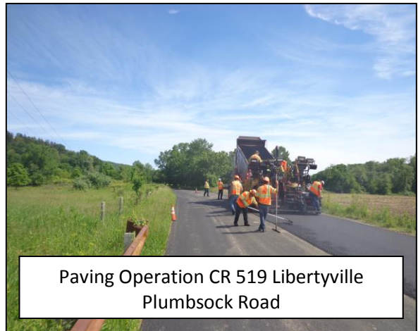
Paving Operation CR 519 Libertyville Plumbsock Road