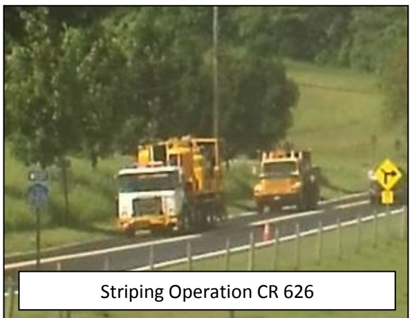
Striping Operation CR 626