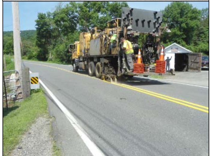
Typical Traffic Striping Operation