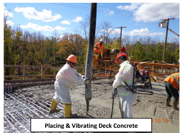
Placing & Vibrating Deck Concrete