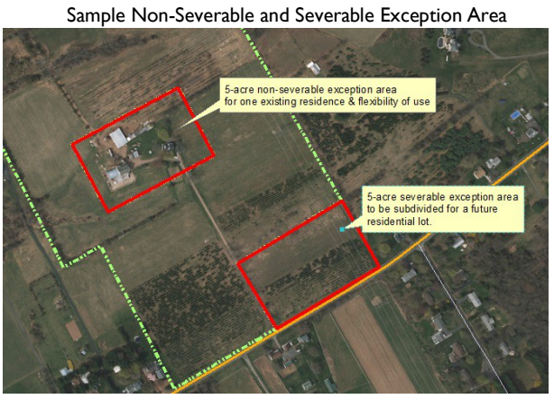
Page 7 of 14