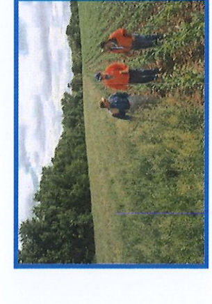
If you participate in USDA programs or the state Farmland Preservation Program, it is very important that you keep your conservation plan up to date. As a program participant you are required to certify every year that you are following your schedule.

Changes in markets, weather, or technology may cause you to reconsider some of the choices you made in your plan. If something happens that would force you to change your decisions, you need to revise your plan. Contact your local Natural Resources Conservation Service office to discuss any changes you propose.