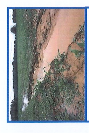
Before: Corn-soybean rotation Moldboard plow Up and down hill Erosion = 8 tons/acre/year