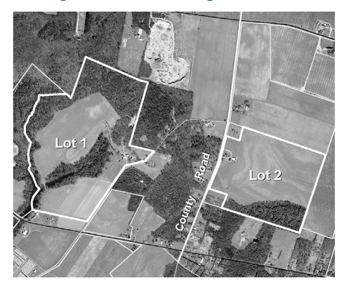
Diagram of a Contiguous Division