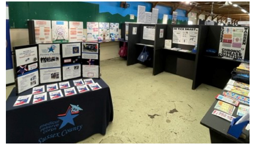
MRC Recruitment table amongst other Division of Health Educational Tables

Medical Reserve Corp (MRC) volunteers attended the fair to promote the MRC and offer an