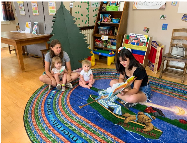
Teen volunteer reads to participants in the Book Buddies Reading Program at the Dennis Branch.

Newton, NJ – The Sussex County Library System (SCLS) is thrilled to announce its lineup of upcoming programs designed specifically for teens and tweens this fall. These events aim to provide a welcoming and exciting space at the library for young minds to explore, connect, and grow as part of the library's commitment to lifelong learning.