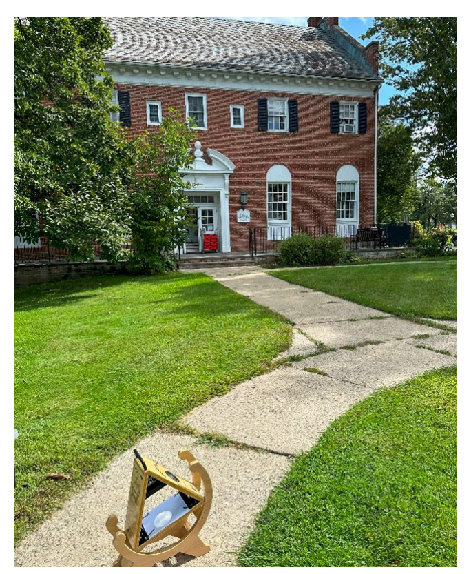
The sunspotter telescope outside of Dennis Library at the Spot the Sun STEAM event in September